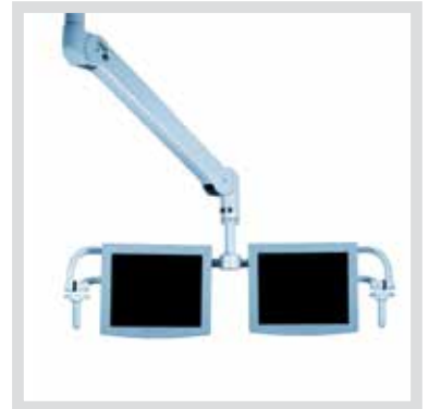
Double flat screen