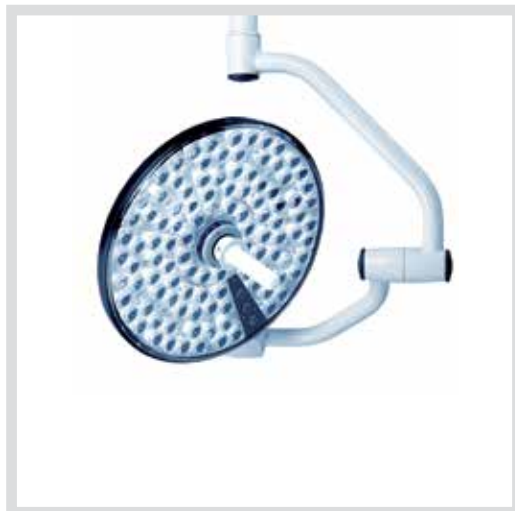
HLED 300 Single Fork or Double Fork version