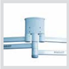
SATELITE™ Media System