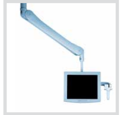
Single flat screen