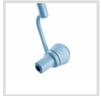
Orchide HD™ camera