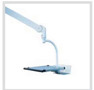
Electro-surgical unit support or laptop holder