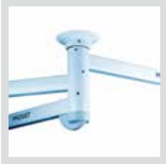
Classic anchoring system