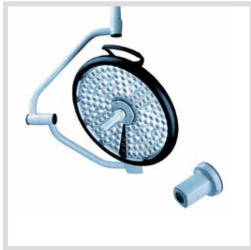
HLED 500 Single Fork or Double Fork version