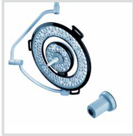
HLED 700 Single Fork or Double Fork version