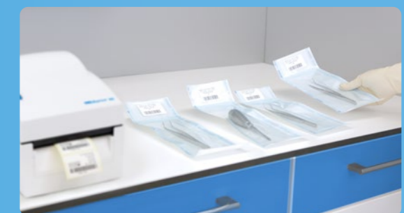
✓ Marking with MELAprint 80