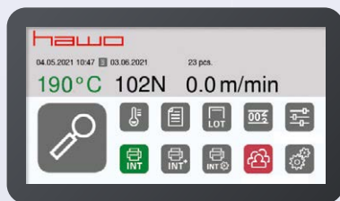
Self configurable main screen